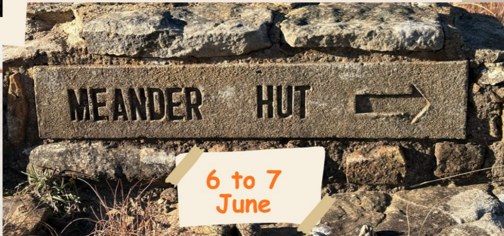
6 to 7 June

Make this choice for the sake of your future self