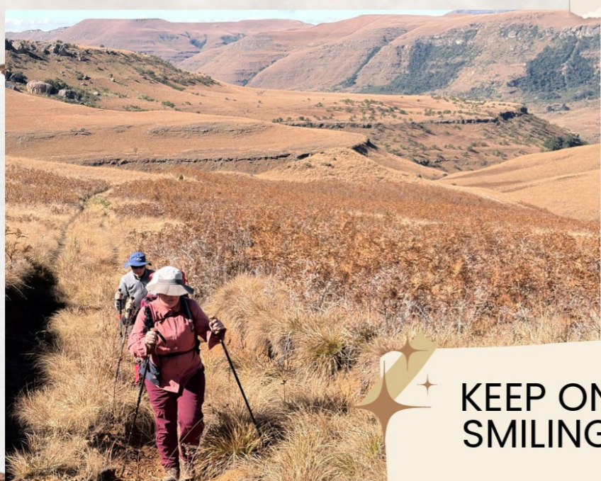
KEEP ON SMILING