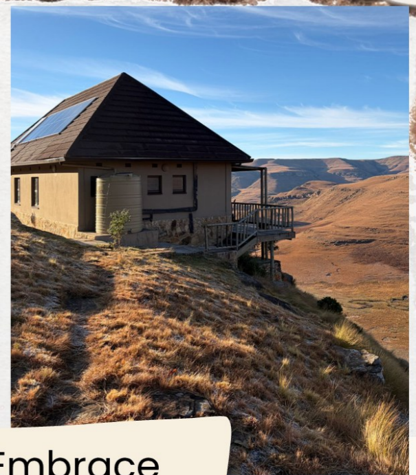
Embrace the beauty of nature