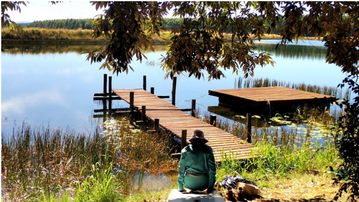
The dams located alongside Alex's Alley