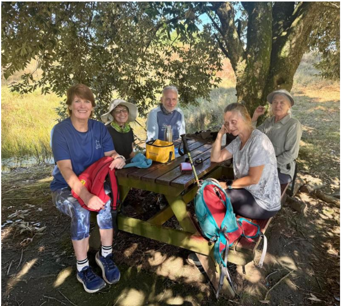
Lunch at the dam

The trek down to our start outside Amber Ridge gate was along paths that have not been maintained for a long time and we had to trudge over sticks and leaves that littered the path all the way down. We made good time and were back at the cars by about 12H30. Good company, good weather and interesting trails made it another exhilarating and memorable outing in our local natural environment.