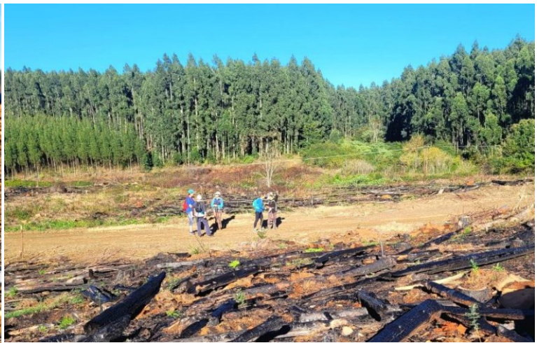
Our small group of hikers

We followed the following mountain bike trails, the names of which raises questions as to how those names were derived. They hark back to the days of the Howick Mountain bike club which existed up until 2020, before it was absorbed into the Karkloof Country Club. Rushalot was challenging in places – slippery and steep. Obviously built as a downhill MTB track, hence the name.