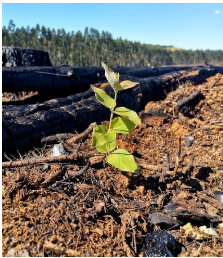
Newly planted Eucalyptus tree