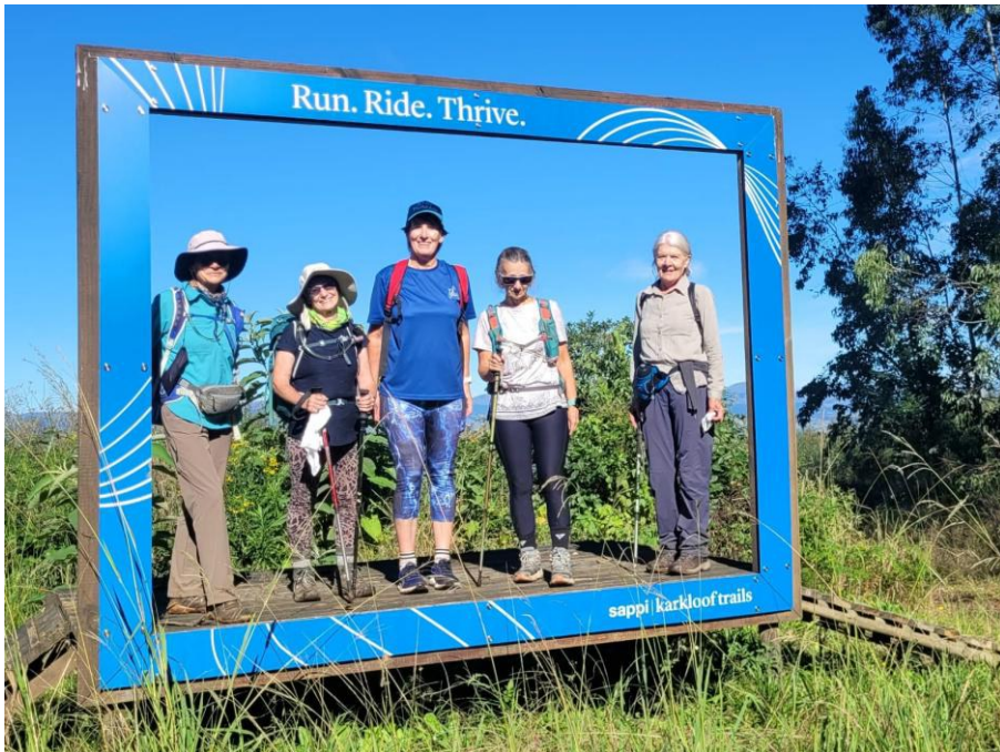
Happy hikers at the highest point on the route

We enjoyed a brief respite at the tower after hauling our bodies up Kathryn's around rocks strewn in the path and then headed down to the dams via Up some More, in this case down some more.