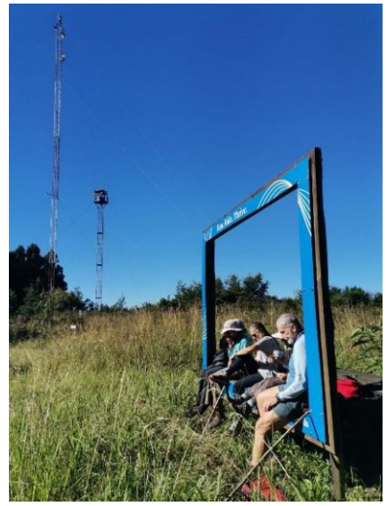
Coffee break at the tower