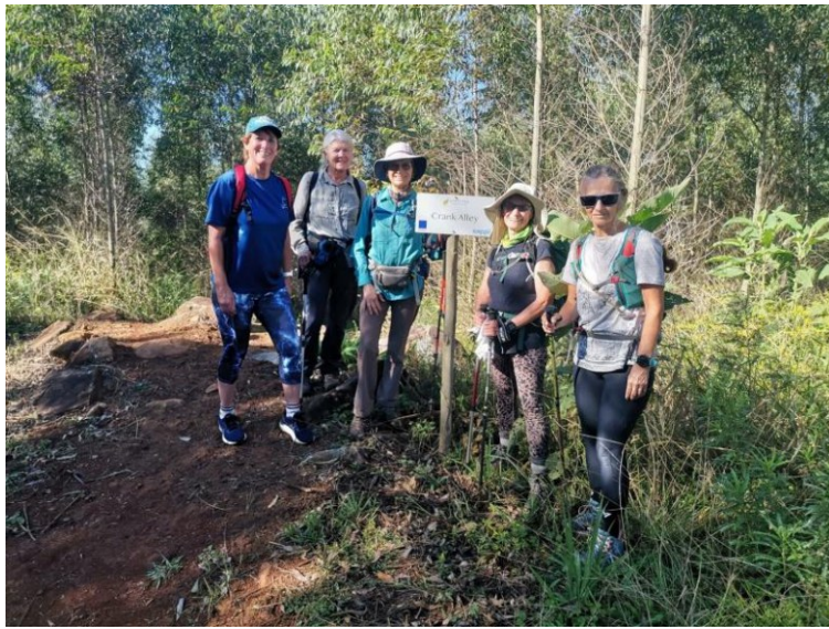
At the top of Haibo